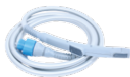
Ergonomic steam handle