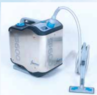
SP 500 / SP 540H / SP 600