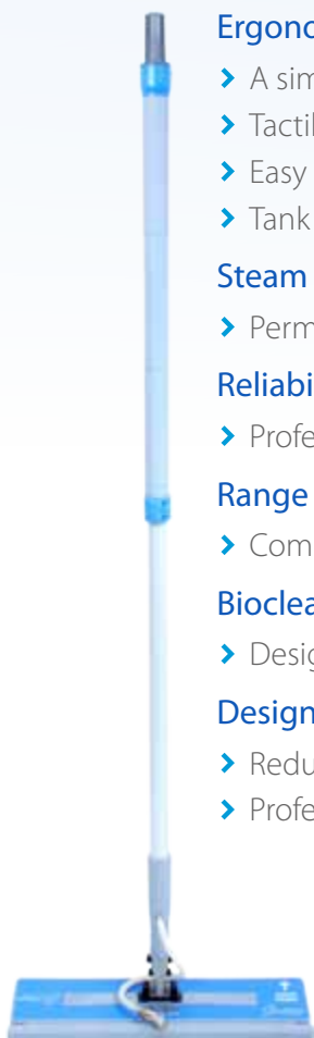
Floor STEAM MOP brush